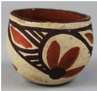
Cup, Santa Clara Pueblo, Earthenware and slip, 20th Century

Don't have clay? Use paper and your preferred drawing or painting medium to create your own artwork inspired by what is seen in the book and the pieces in the Museum's collection. We also highly recommend with an adult's help to find other examples of Puebloan art online or at your local library!