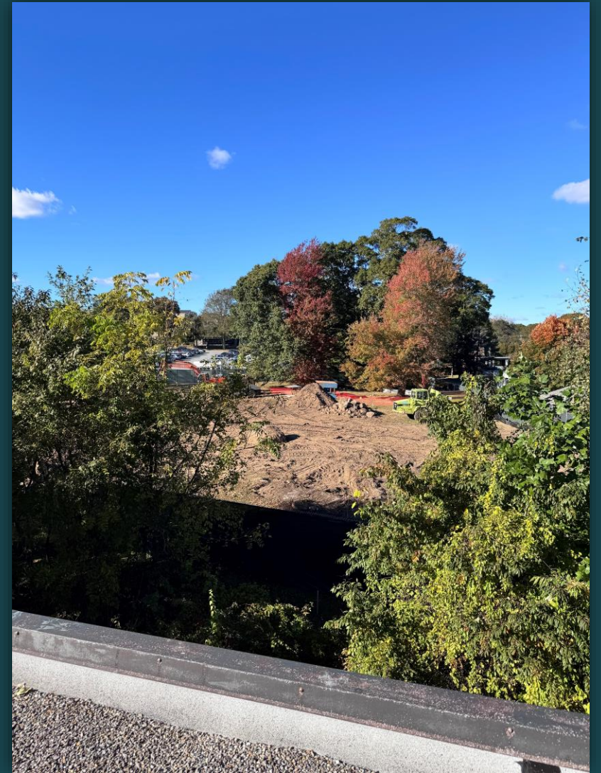
Arial view of where the new parking lot will be behind the Museum near Connecticut College's south parking lot.