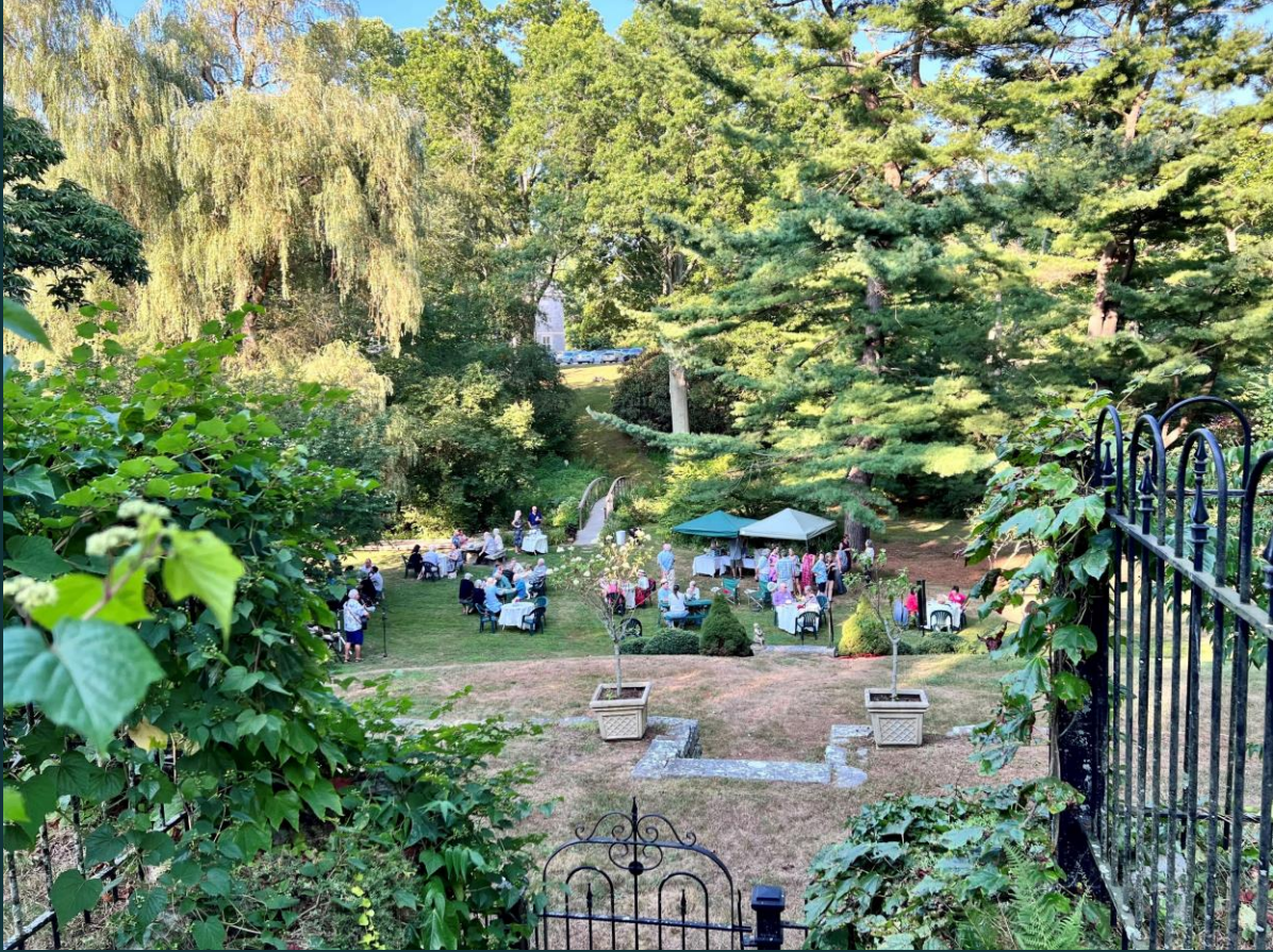
2022 Members' Garden Party