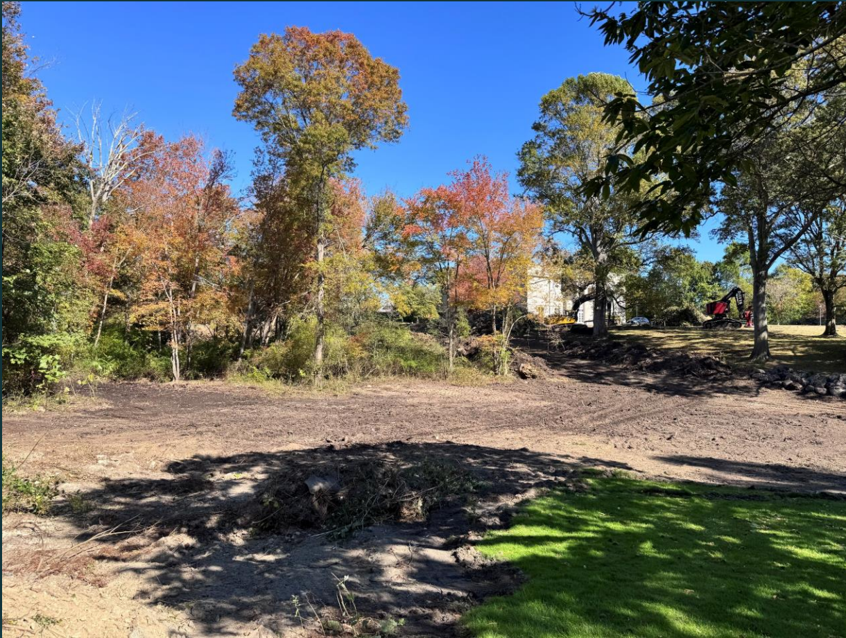
View of the grounds by the Deshon-Allyn House where the new eco-friendly filtration pond will be.